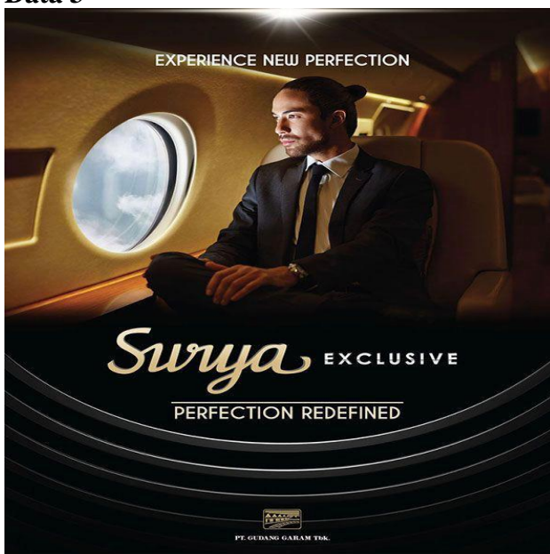
Figure 3. Surya Exclusive Cigarette Advertisement