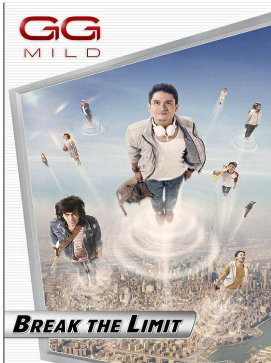
Figure 6. GG Mild

For the first verbal sign “GG Mild” it is literal meaning to inform about the brand of the product. Which is the produced from Gudang Garam family and made from the best blend of Indonesian cigarette. For the second verbal sign is “Break the Limit”. The word “break” has meaning to separate suddenly; to violently into two or more pieces; to stop working by being damaged. While the word “limit” means the greatest amount; number; or level allowed or possible. This sentence inform the readers that this cigarette limiting beliefs don’t belong in life.