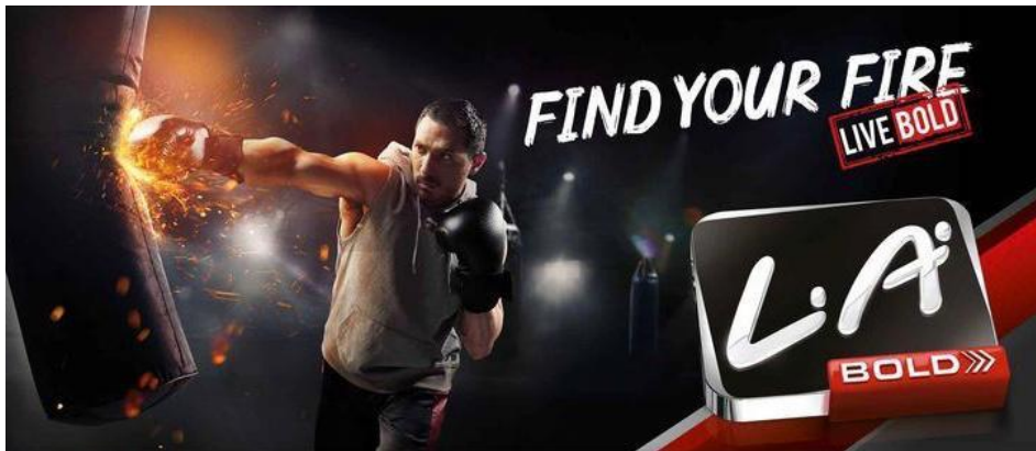
Figure 4. LA Bold Cigarette

In this advertisement, the verbal sign is a brand name of the product namely “LA Bold” and the slogan “Find Your Fire Live Bold” which white color. According to term of theory by Ceratto (2012) white means goodness, hygiene, justice, perfection, and purity. The meaning of the slogan itself persuade the audience to finding passion to the readers and give new meaning to social life in addition can be the best version in mentally, emotionally, and physically.