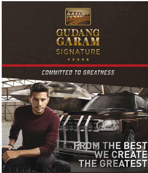
Figure 7. Gudang Garam Signature

For the first verbal sign in this picture “Gudang Garam Signature” it has literal meaning that the product produced from Gudang Garam Tbk variant signature.