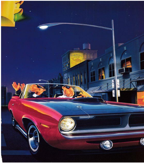
Figure 5. Camel Lights

The verbal sign of this cigarette advertisement is “Camel Lights” which is describe of brand namely of the product itself.