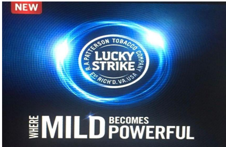
Figure 8. Lucky Strike

The first verbal sign is “R.A. Patterson Tobacco Company. Lucky Strike. Est. Rich’d. VA. USA”. The statement tells about the name of the product. Which means, Lucky Strike is an American brand of cigarettes owned by the British American Tobacco group, it was introduced as a brand of chewing tobacco by American firm R.A. Patterson in 1871. This verbal sign is categorized as denotative meaning for the reason that inform the readers about the product itself.