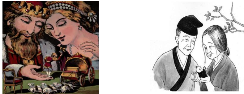
Figure 1. Tom Thumb and Issun Boshi

It can be said that the stories about Tom Thumb and Issun Boshi are two stories with the same concept, namely that humans are born with a size of no more than 1 inch. This can be seen from the illustrations provided by Bros (Bros, 2019) and Issun Boshi provided by Forestpub (Forestpub, 2022).